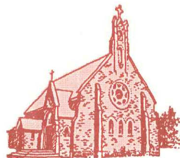
ST. MARY'S, ACHILL EST. 1875