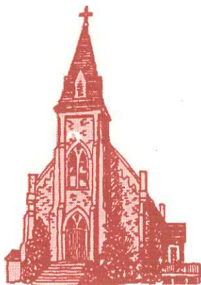
ST. FRANCIS XAVIER, TOTTENHAM EST. 1885