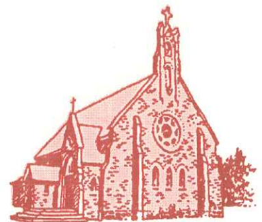
ST. MARY'S, ACHILL EST. 1875