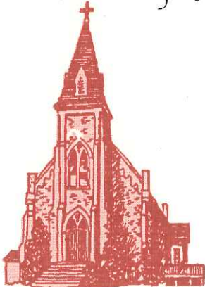
ST. FRANCIS XAVIER, TOTTENHAM EST. 1885